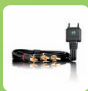
TV-out Cable ITC-60