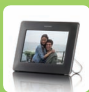
Digital Photo Frame IDP-100