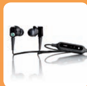
Noise Cancelling Headphones HPM-88